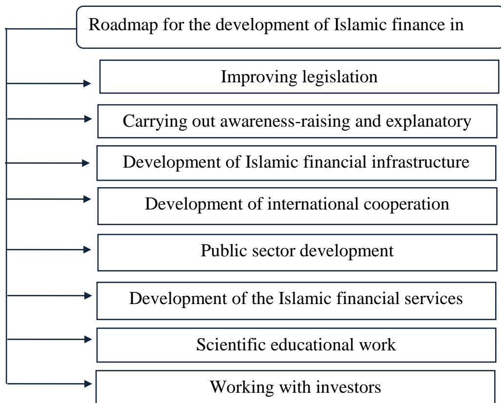
Figure 3. Roadmap for the development of Islamic finance in Kazakhstan [6]

The main condition for the effectiveness of this model is the establishment of Islamic financial infrastructure in the country. We have mentioned above that the dualistic model is considered to be effective when compared to the traditional and monistic model, as is clear from the experience of countries that have introduced it today. The introduction of the dualistic model will create competitive environment for Islamic finance and the activities of competing financial institutions, encourage competition between them, and lead to the emergence of new products.