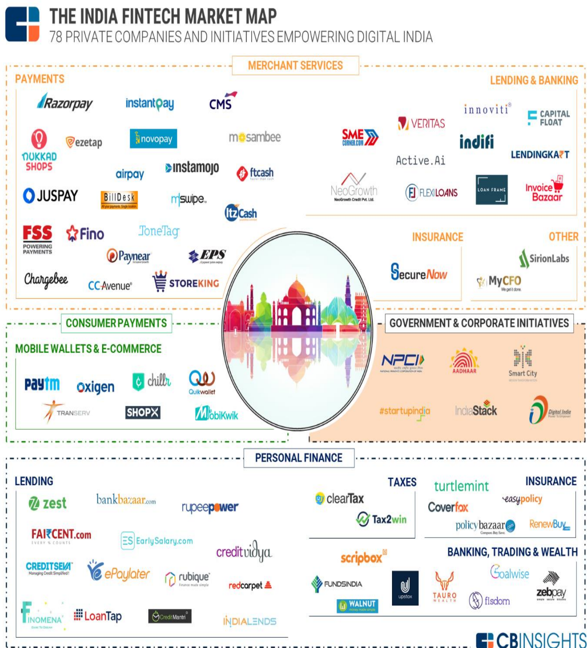
Figure 2. The Fintech Market in India 2

It is also important to point out what is not fintech. Companies that offer traditional services or solutions to new consumer markets are not considered fintech in our conception. Nor are simple, straightforward extensions of a company’s principal business activities.